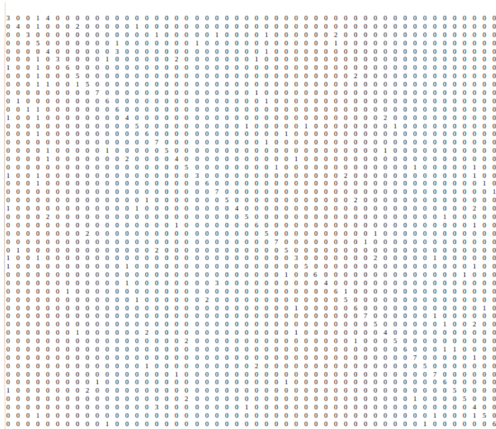
Figure 5. Sound classification confusion matrix

From this confusion matrix we can see that approach with autoencoder augmentation can lead to quite accurate classification. The maximum row element in the matrix is on the diagonal for most classes. Thus, there are 253 observations predicted as true positive from total 400, therefore, there is room for improvement the accuracy.